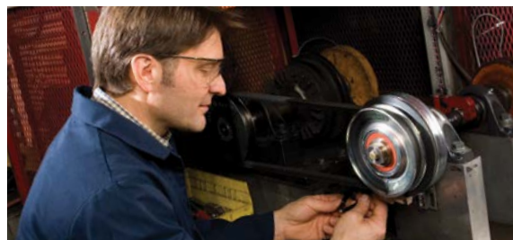
In-house inertia test stands feature belt-driven motors that allow zero-hour prototype brake and clutch torque testing.

Warner in-house testing capabilities include ANSI stop times, cycle tests, blade spindle bearing temperature and other mower performance parameters. Three large environmental test chambers can each house an entire mowing machine. These chambers allow for 24/7/365 unattended tests that simulate a variety of high-temperature conditions combined with load cells that simulate different grass mowing conditions.