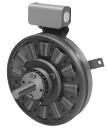
SFC (Stationary Field Clutch Coupling)