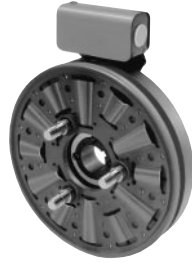
SF (Stationary Field Clutch)