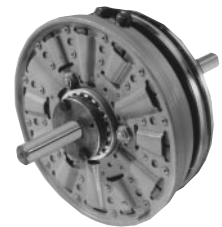
PCC (Primary Clutch Coupling)