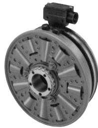
PC (Primary Clutch)